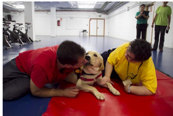
EXERCISES OF EMOTIONAL EXPRESSION AND LINK